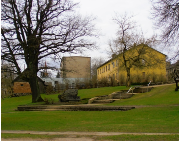
3. "400 Years of Valga-Valka" memorial