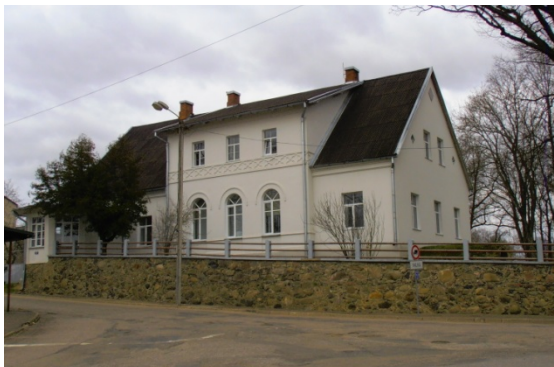
1. Valka Courthouse