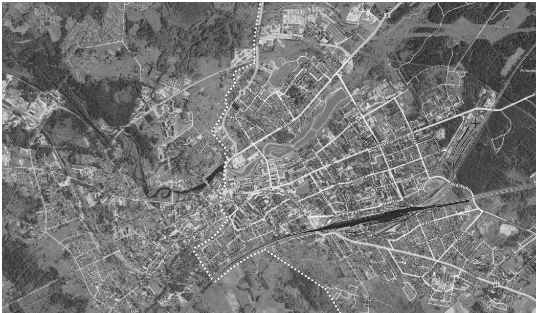
Valga-Valka ortho photo, Source: Estonian Land Board, 2015