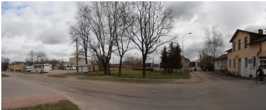
11. Bus operating area (view from Raiņa and Latgales street crossing)