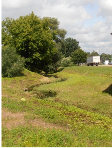
27. Varžupīte-Konnaoja Creek