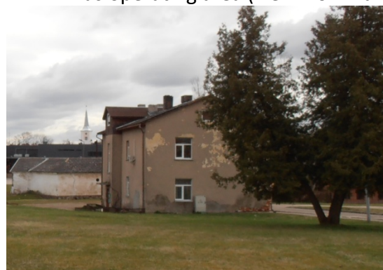
12. Residential building