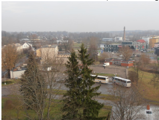
18. Bus station, market and shopping Centre "Rimi" (view from Lugaži Church tower)