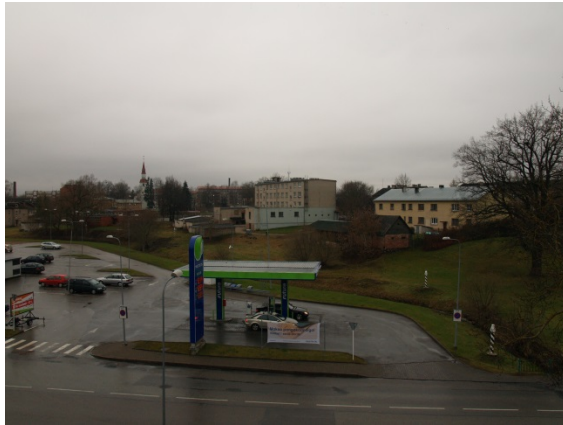
20. Petrol station (view from “Rimi” roof)