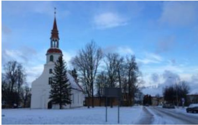
9. Valka Lugaži Church (under heritage protection)