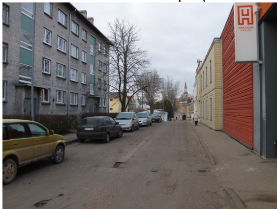
22. Apartment house on Sõpruse Str.