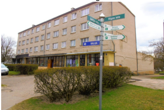
5. Mixed use building