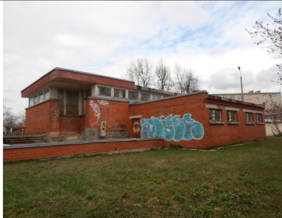
7. Underused market pavilion