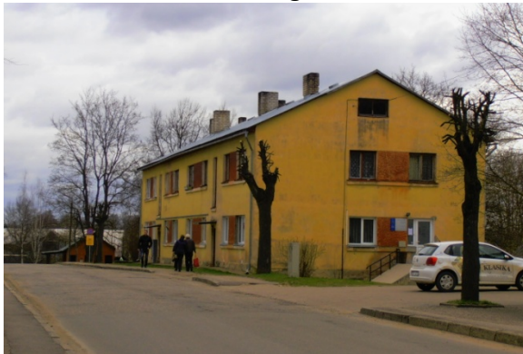
4. Residential building