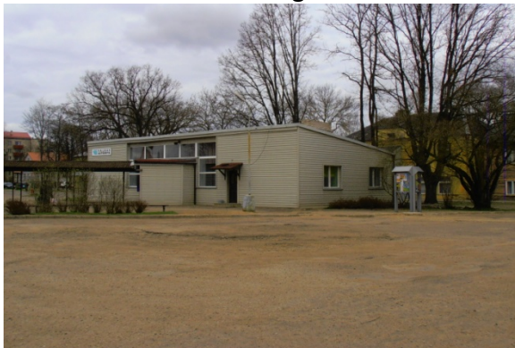
6. Valka Bus Station