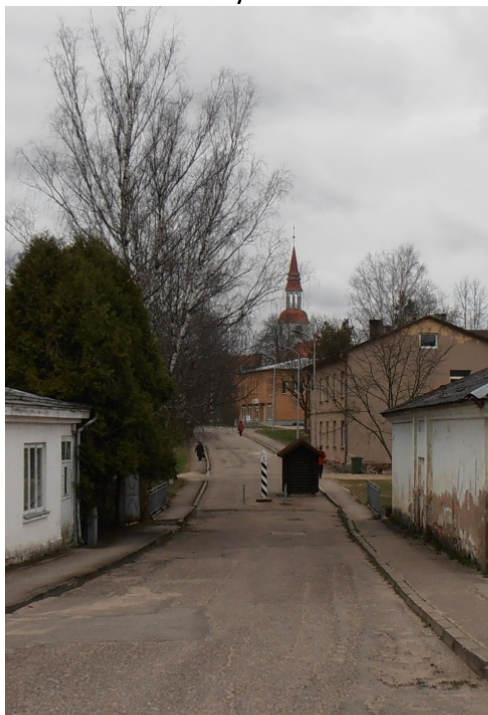
14. Raina - Sõpruse Str.