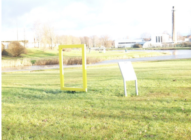
26. National Geographic's yellow frame