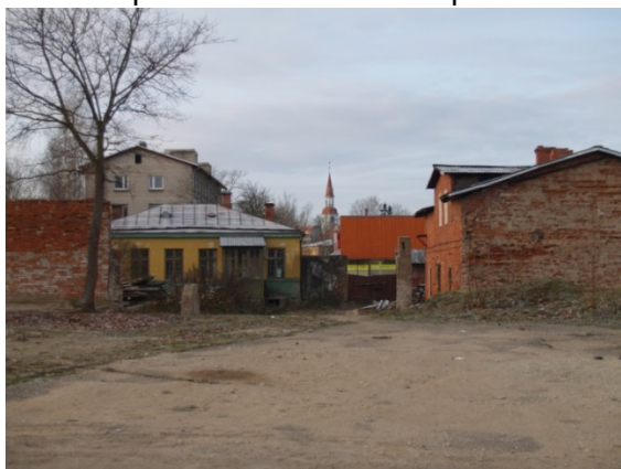
23. Valga historical centre with the view to Lugaži Church tower