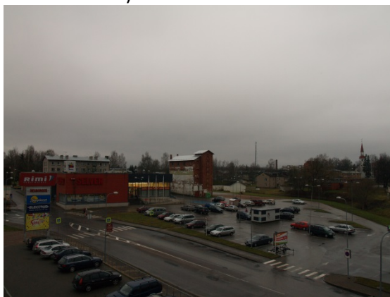
19. Shopping Centre "Selver" with former Winery tower (view from "Rimi" roof)