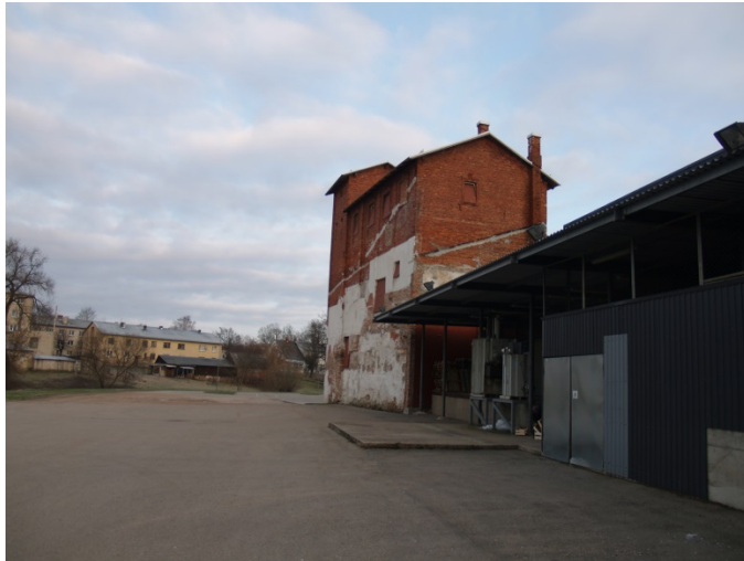
13. Old Winery tower