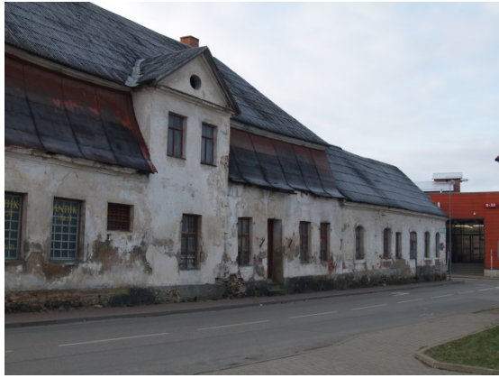
16. Former County (Kreis) Authority Building (under heritage protection)