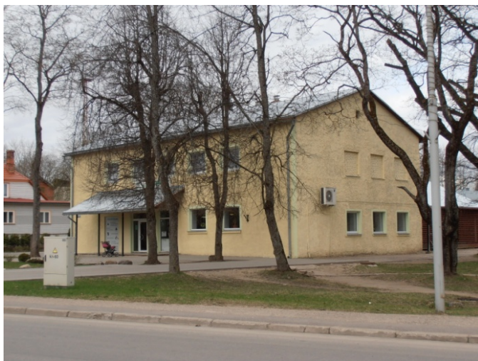
8. Bistro and hotel „Jumis”