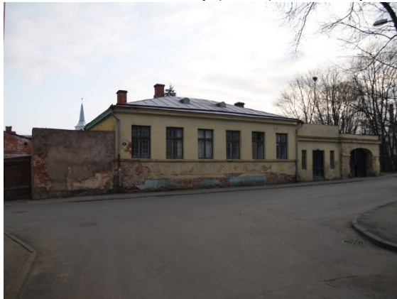
17. Former Post Station (under heritage protection)