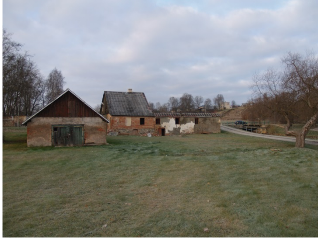
24. Former Ramsi Watermill (under heritage protection)