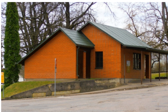
2. Former Border Checkpoint