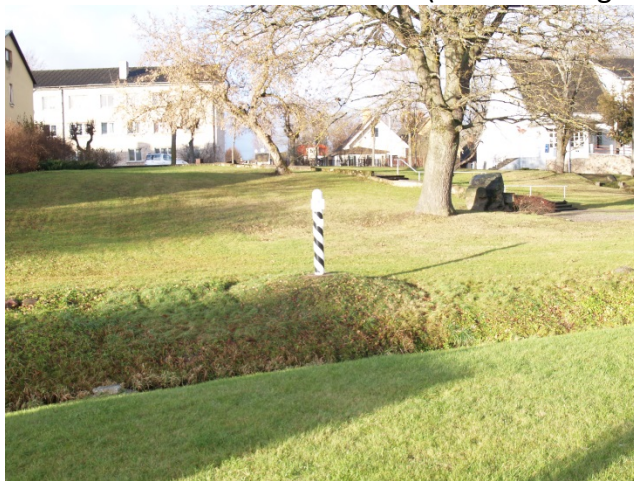
25. Border -post