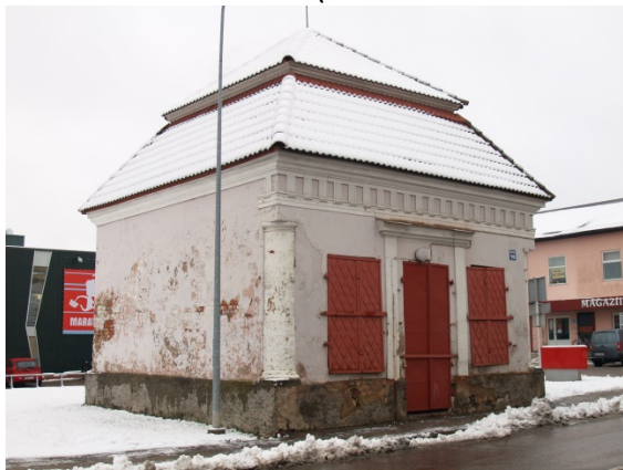
21. Roman Catholic Chapel (under heritage protection)